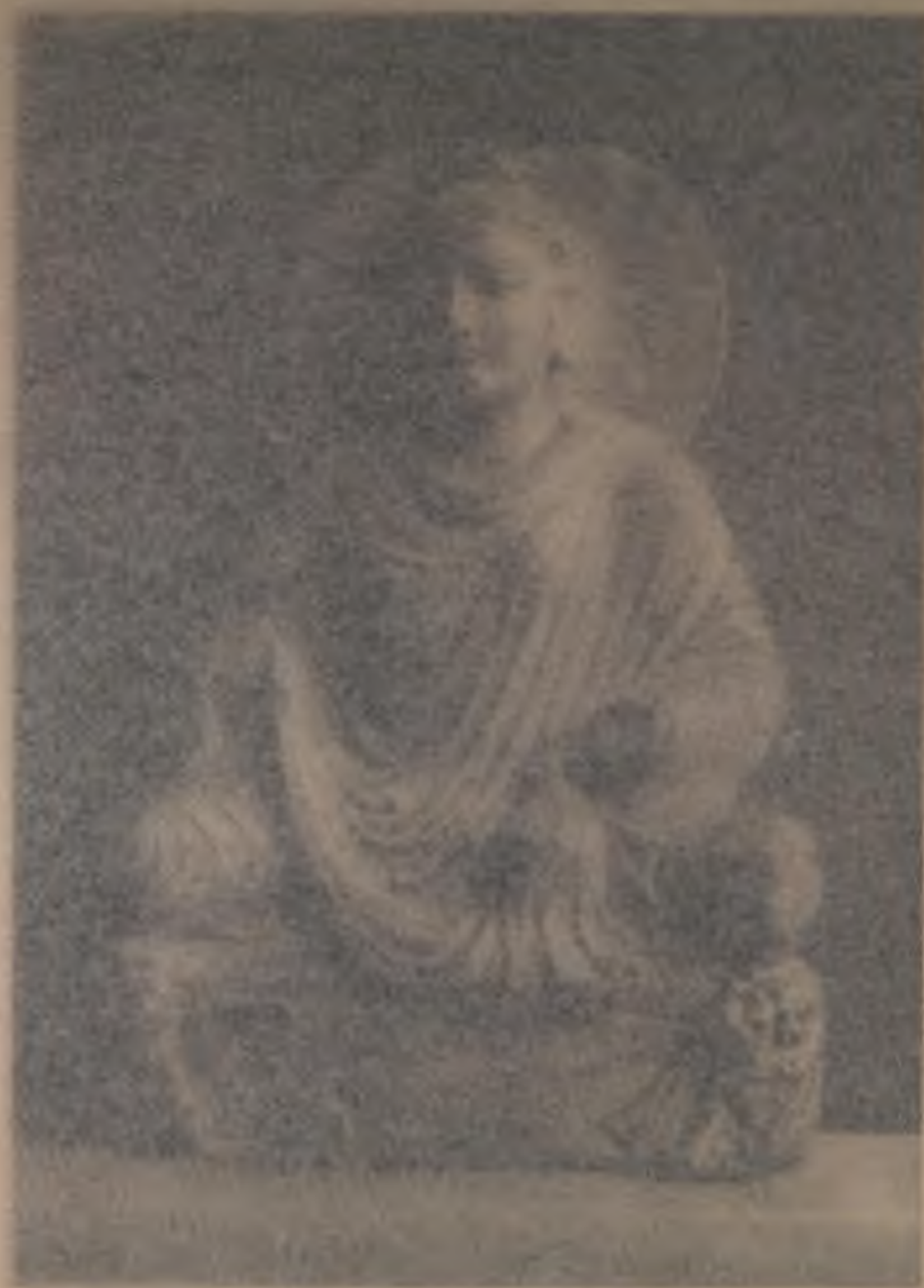
The Bodhisattva, from the Fudo-Butsu page 17